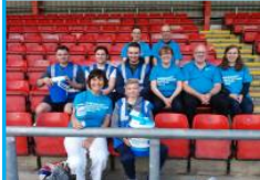
Collection at Crewe Alexandra Football Club

The Crewe and District Branch of Parkinsons UK